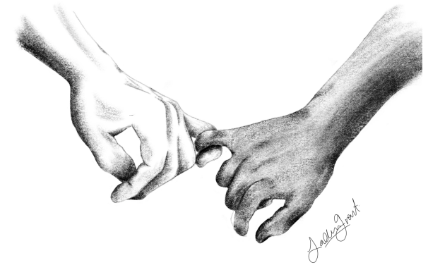
Drawing by Jaden Grant Grade 9, East Wiltshire School