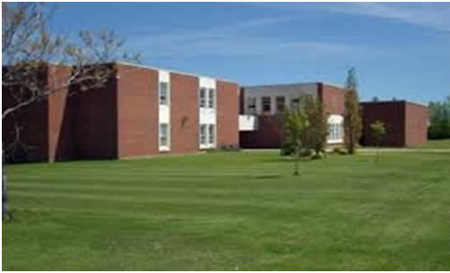
Three Oaks Senior High School